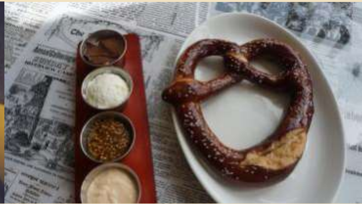
Tuba Baking has opened on Pike St. in Covington! Homemade German Pretzels and Artisan Beer and more!!